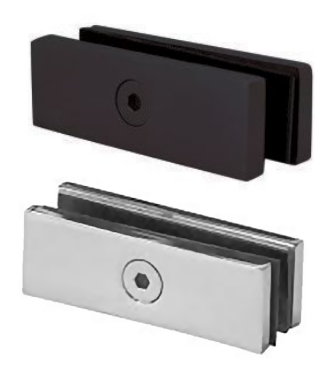
180-DEGREE GLASS CLAMP Matte Black or Polished Stainless Steel