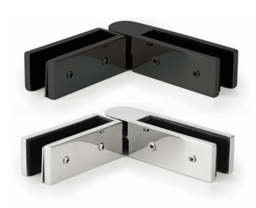
ADJUSTABLE GLASS CLAMP Matte Black or Polished Stainless Steel